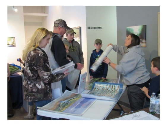
Somerset County Conservation District