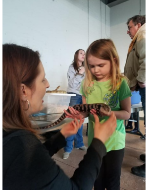
Cambria County Conservation District