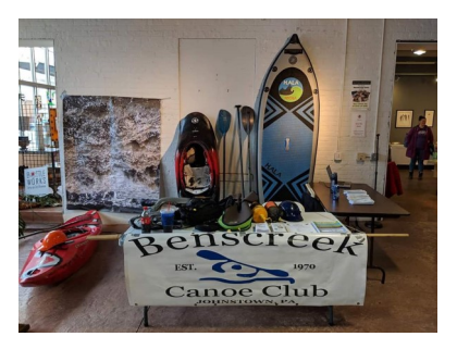
Benscreek Canoe Club