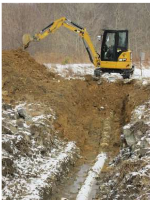
Upgrades have been recently completed at Oven Run AMD Passive Treatment System Hawk View Site along the Stonycreek River.

The District received a PA Department of Environmental Protection Growing Greener Grant in the amount of $704,000.00 recently to significantly rehabilitate several of the Oven Run systems. However, due to permitting, design and contracting requirements the work funded by the grant will not begin until at least late this year. The current rehab work is being funded by the much more limited District funds.