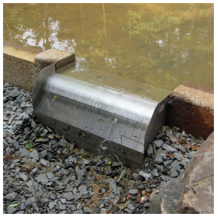
Left-Oven Run AMD Treatment System Site D aka Oaks Trail under reconstruction.

Above- The functioning Coanda Screen at the Oven Run Site A intake.