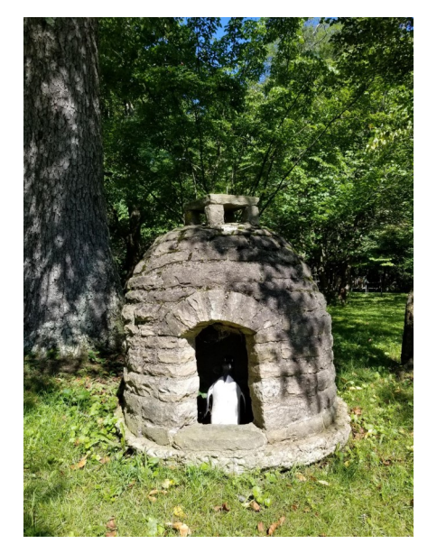
One of the three igloos staff would cover with ice for the penguins.