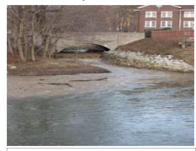
Sediment laden mine pool water enters the Stonycreek River at Hooversville.

The PA DEP District Mining Office is accountable, along with Marquise Mining, for finding a permanent solution of the issue. Meetings scheduled between the two are and will be held to work toward that goal.