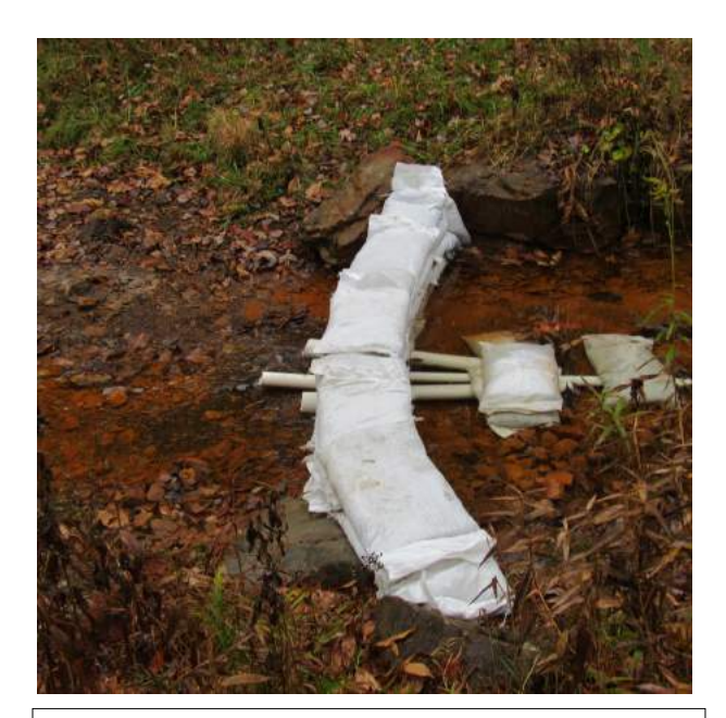
An oil absorbent boom placed in Oven Run just upstream from the intake for the Oven Run AMD Treatment System Site A.