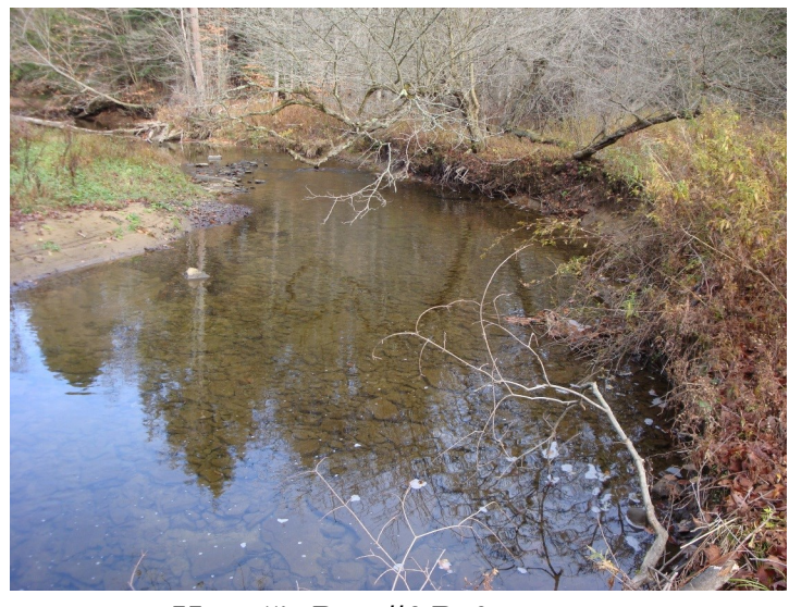
Howell's Run #3 Before