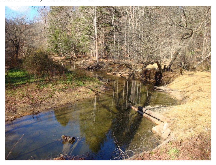
Howell's Run #3 After