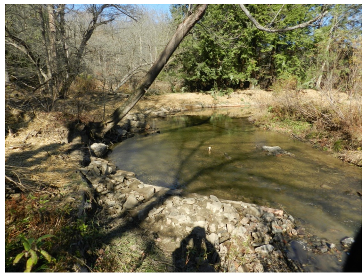
Howell's Run #2 Before