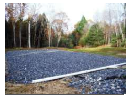
Weaver Run D8A Treatment System.