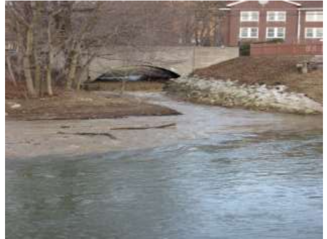
Sediment laden mine pool water enters the Stonycreek River at Hooversville.

The PA DEP District Mining Office is accountable, along with Marquise Mining, for finding a permanent solution of the issue. Meetings scheduled between the two are and will be held to work toward that goal.